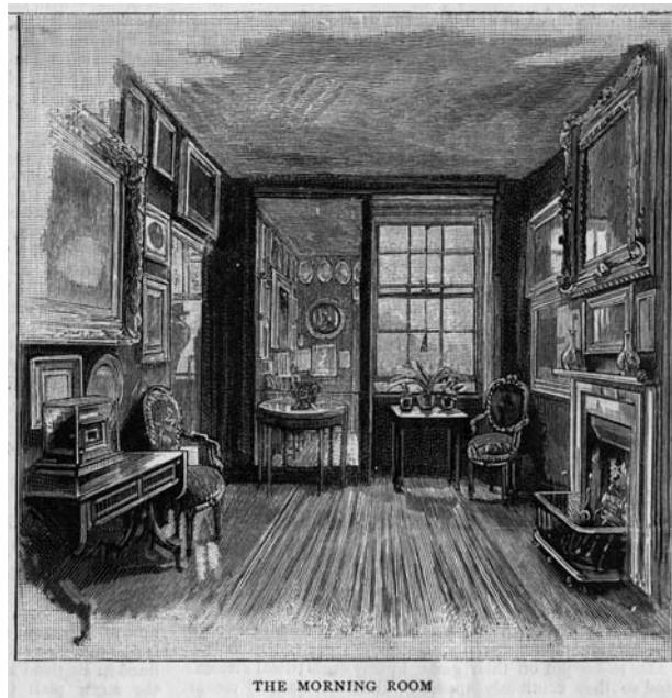
The Morning Room, one of the many new rooms that will be restored and opened to the public as part of the Opening up the Soane appeal. This room, illustrated here in the Graphic Magazine 1884, is currently used as an office on the second floor of No.13