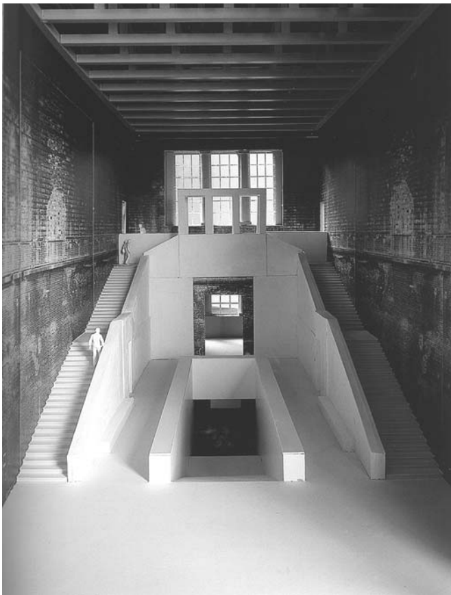
Model for the reconstruction of the stairhall, Neues Museum, Berlin